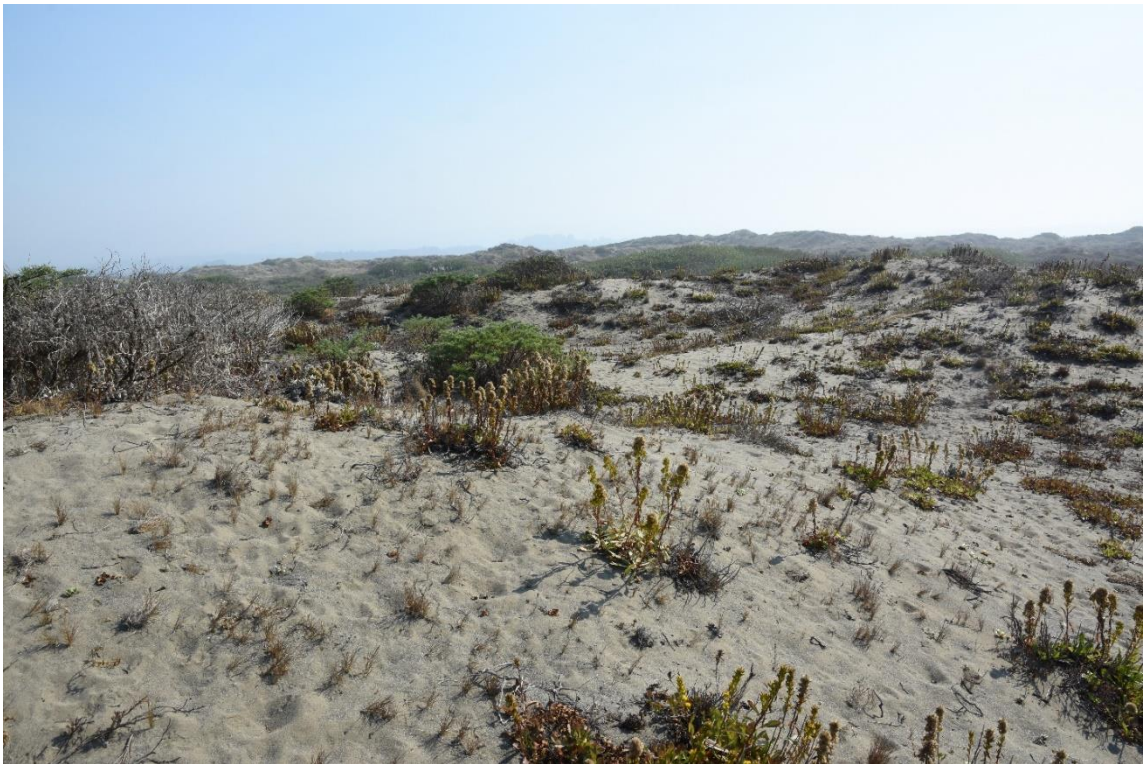
• Above: dune mat in foreground.