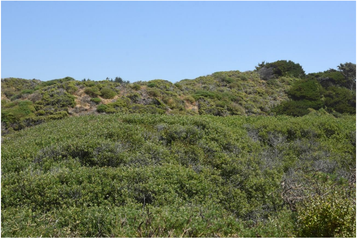
Above: willow swale in foreground