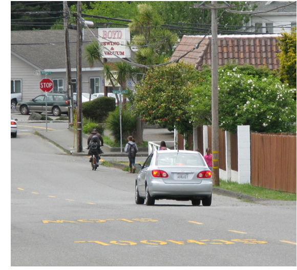
Kids walking to school on a street without sidewalks