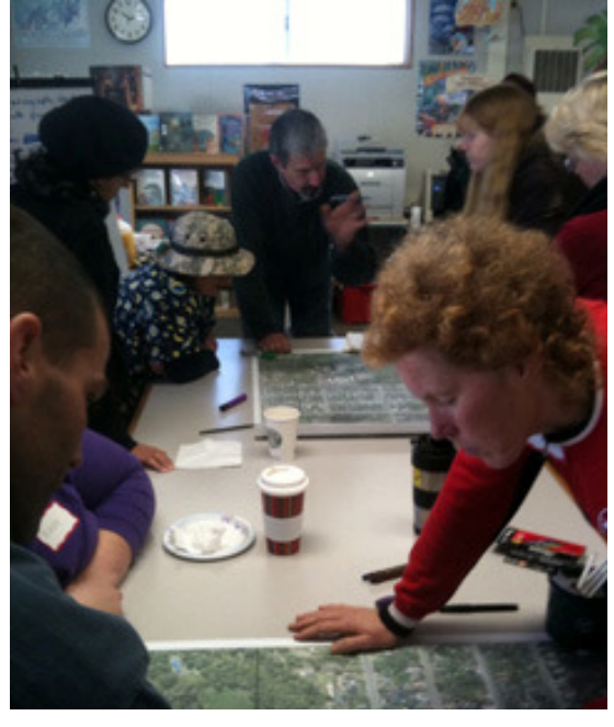
Walkability Audit participants work together to identify priorities and recommendations

Recognizing the benefits of Walkability Audits, HCAOG included two Walkability Audits as part of this project, selecting one school within a city jurisdiction and one school in the unincorporated County. The draft Prioritization Tool criteria were tested initially to select the schools for the walkability audit. In testing the tool, schools were run through the criteria and those that received the highest scores were prioritized as pilot schools for Walkability Audits. As described in above, secondary criteria were established for the tool to determine whether or not schools have previously received SR2S funding or had a prior Walkability Audit within the past five years.